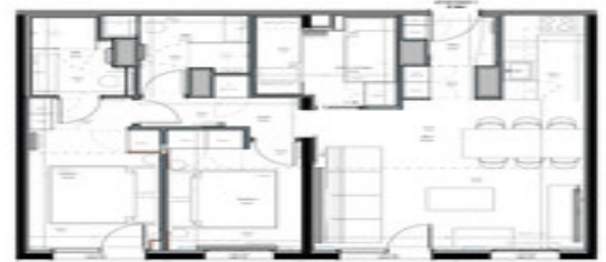
Appartement T3 + coin montagne 67.48m 2 R+2