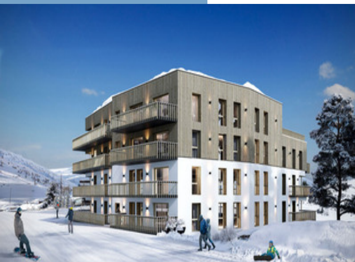
D405 LODGE 4 CHAMBRES + 1 CABINE LODGE 4 BEDROOMS + 1 CABIN